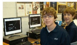
Student Success Room